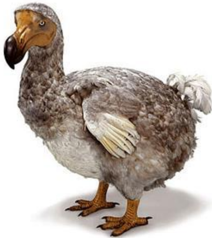
Going the way of the Dodo bird?